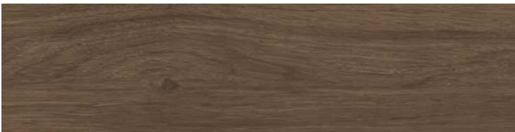
6" x 24" CENTURY WOOD SADDLE HD RECTIFIED PORCELAIN TILE 62-524