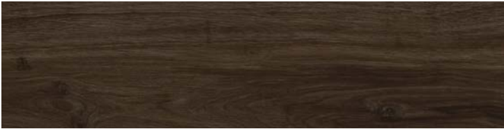
6" x 24" CENTURY WOOD CINNAMON HD RECTIFIED PORCELAIN TILE 62-523