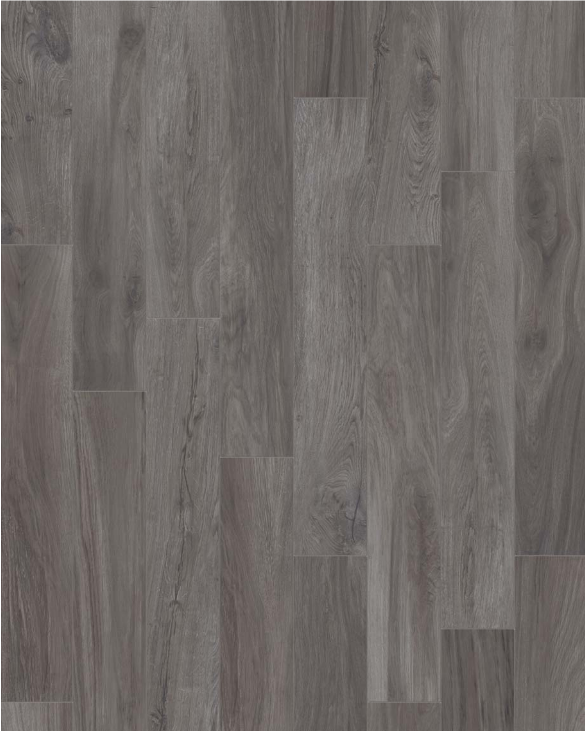
6" x 36" CENTURY WOOD ASH HD RECTIFIED PORCELAIN TILE