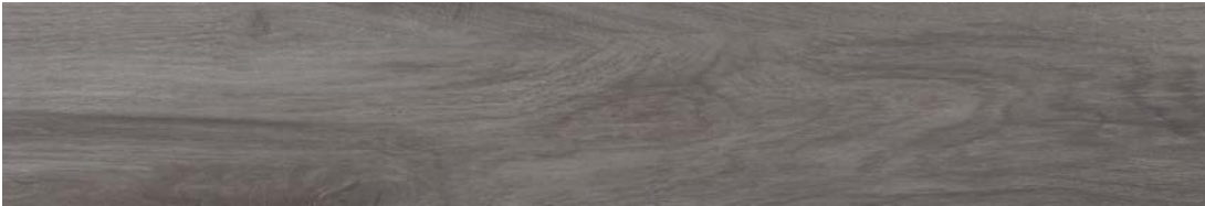
6" x 36" CENTURY WOOD ASH HD RECTIFIED PORCELAIN TILE 62-721