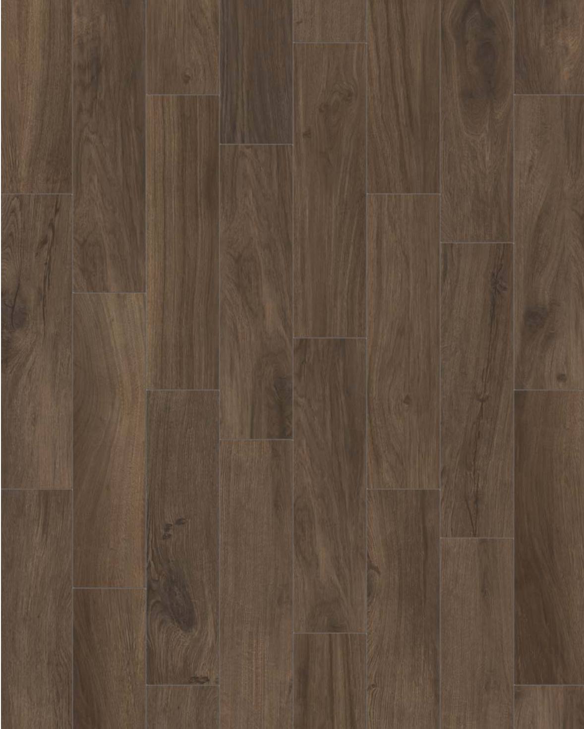
6" x 24" CENTURY WOOD SADDLE HD RECTIFIED PORCELAIN TILE