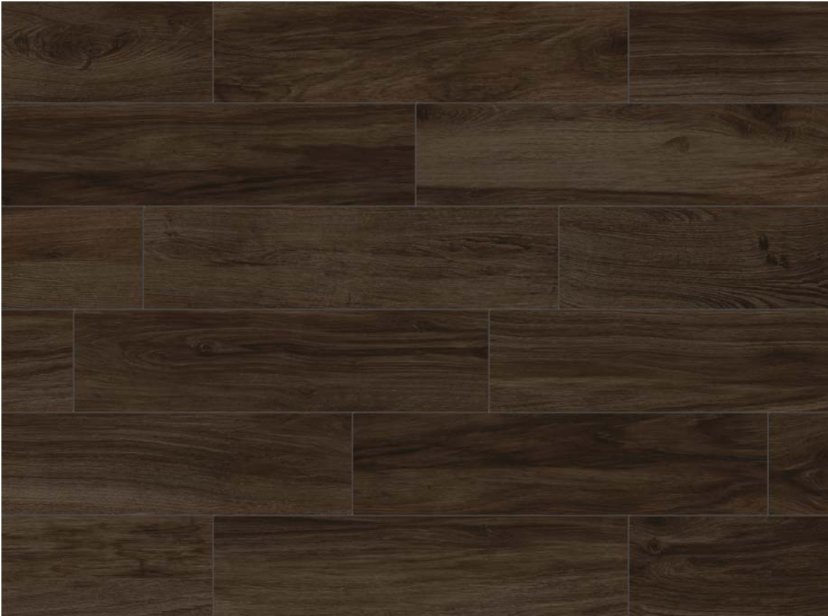
6" x 24" CENTURY WOOD CINNAMON HD RECTIFIED PORCELAIN TILE