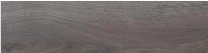
6" x 24" CENTURY WOOD ASH HD RECTIFIED PORCELAIN TILE 62-525