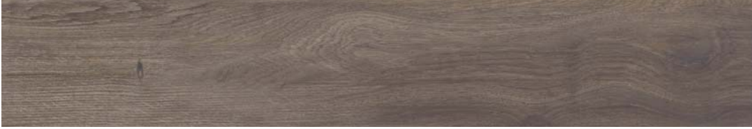
6" x 36" CENTURY WOOD DUNE HD RECTIFIED PORCELAIN TILE 62-722