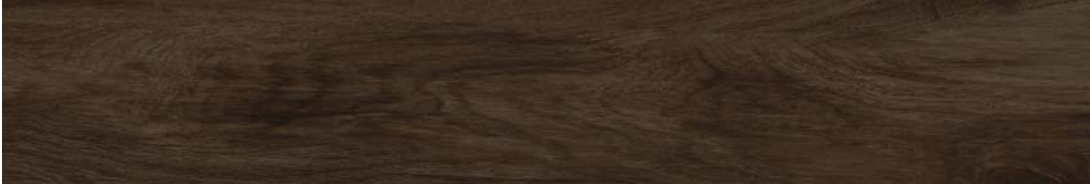
6" x 36" CENTURY WOOD CINNAMON HD RECTIFIED PORCELAIN TILE 62-719