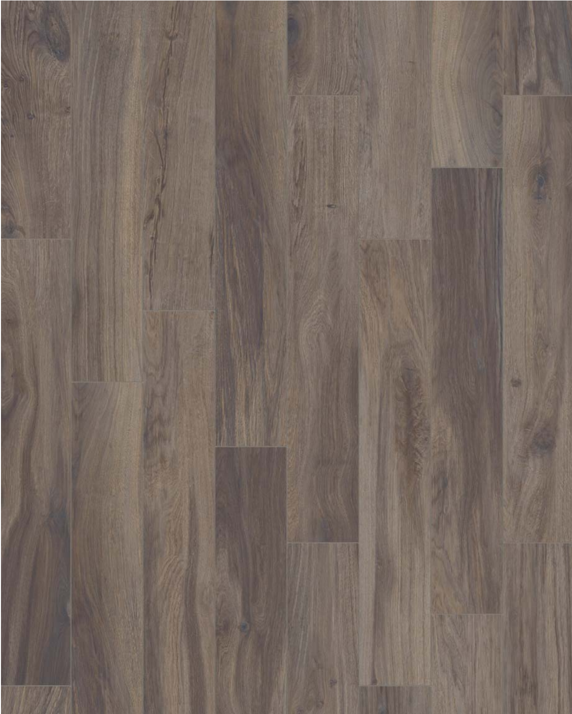
6" x 36" CENTURY WOOD DUNE HD RECTIFIED PORCELAIN TILE