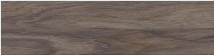
6" x 24" CENTURY WOOD DUNE HD RECTIFIED PORCELAIN TILE 62-526