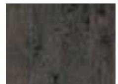
MAPLE Silver Shade ERH5309 5"

25-Year Residential Warranty Engineered Hardwood