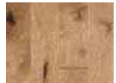
MAPLE Desert Wood ERH5305 5"