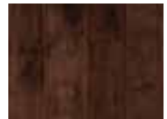
MAPLE Burnt Cinnamon ERH5307 5"