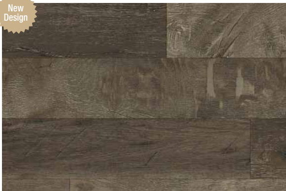
L6621 gray washed