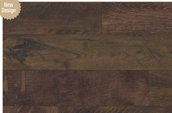
L6622 brown washed

Sizes Widths: 5.59" (142 mm) Length: 47.83" (1215 mm)