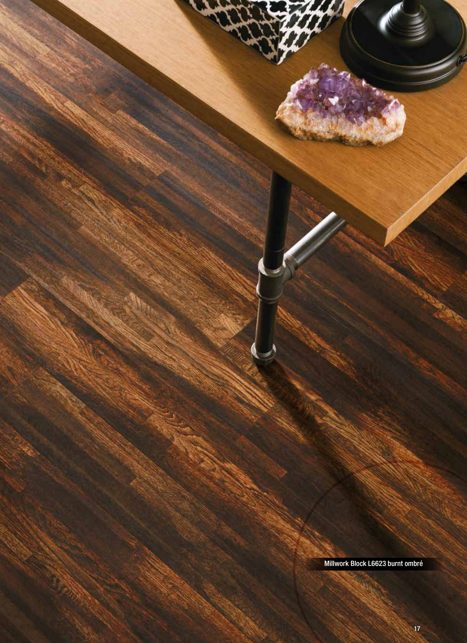
Millwork Block L6623 burnt ombré