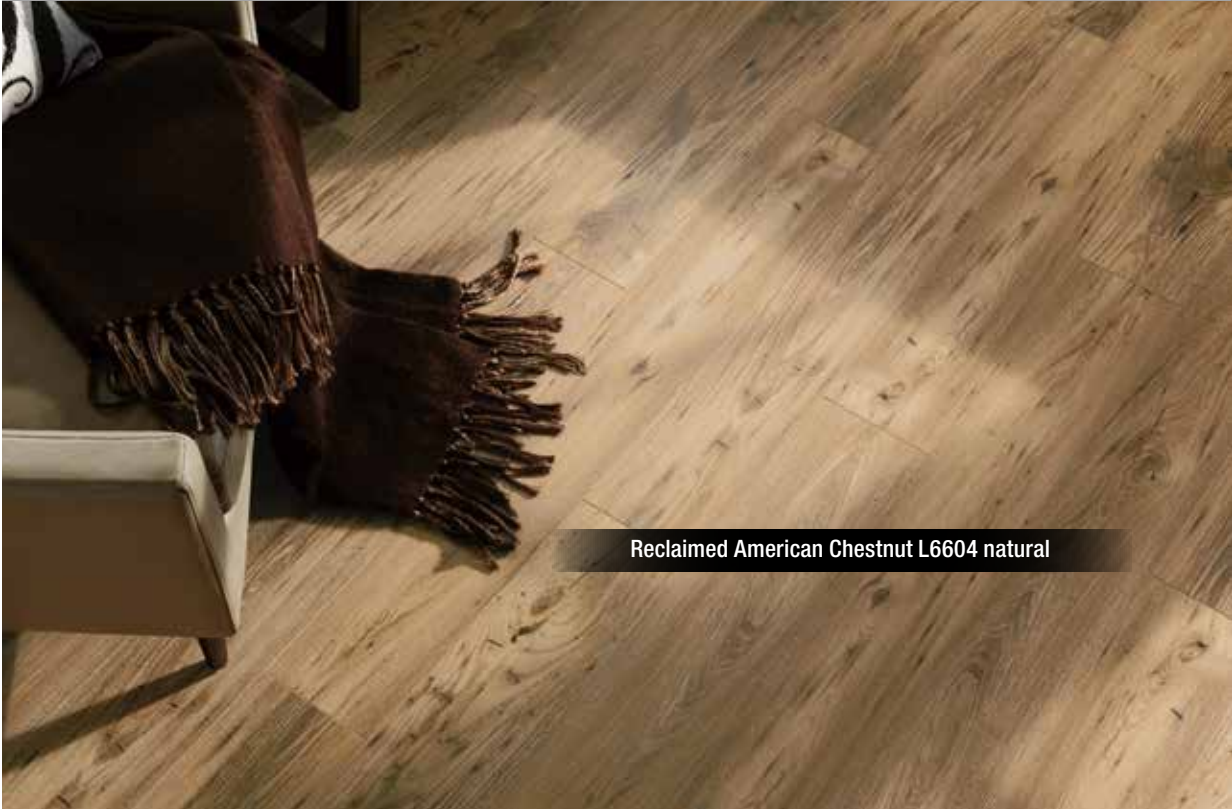
Reclaimed American Chestnut L6604 natural