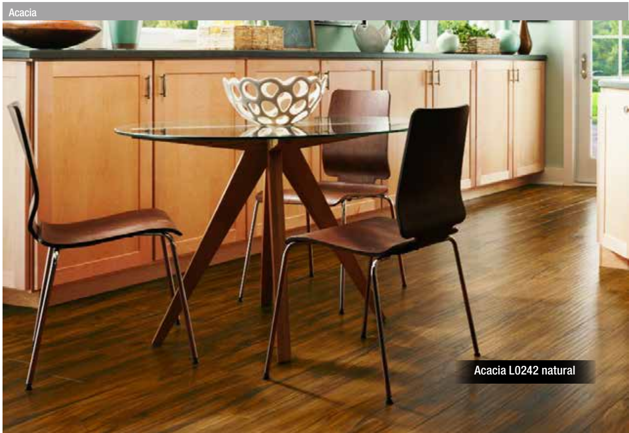
Acacia L0242 natural