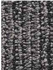
999 Tooled Surface