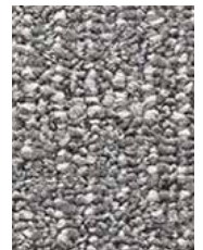
955 Bespoke Fabric