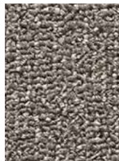
859 Found Object