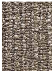
862 Fiber Collage