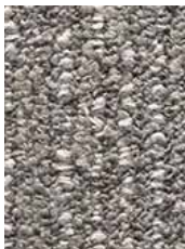
358 Reshaped Felt