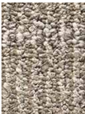
152 Morphed Macrame