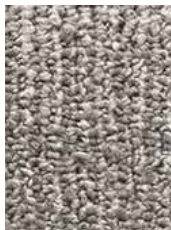
751 Art Cloth