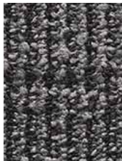
999 Tooled Surface