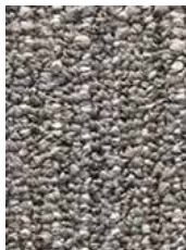
358 Reshaped Felt