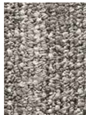
751 Art Cloth