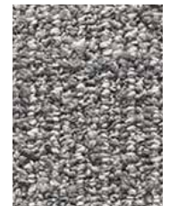
955 Bespoke Fabric