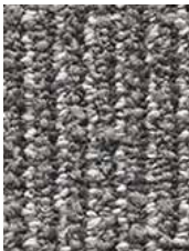
983 Wrapped Shibori