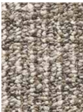
152 Morphed Macrame