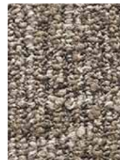
862 Fiber Collage