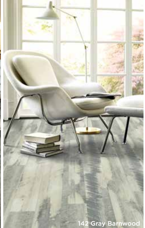
142 Gray Barnwood