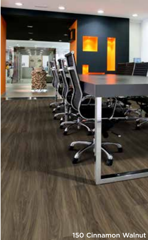
150 Cinnamon Walnut