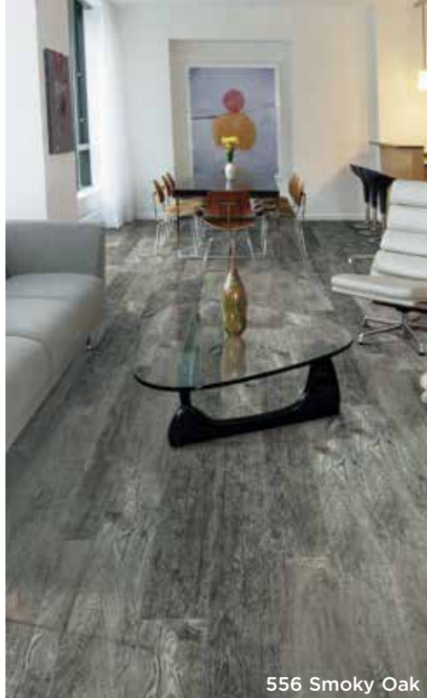
556 Smoky Oak