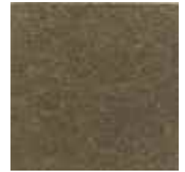
25296 Dark Pebble