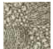
2522B/16x6 Geyser Insert Cold