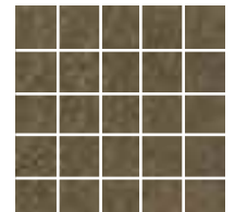
25296/M12 Dark Pebble