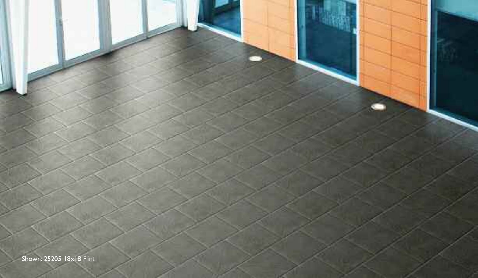
Shown: 25205 18x18 Flint