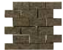
25296/M2x4 Dark Pebble

Shown on Front: 25213 12x12 Gravel, 2522B/L1.25x12 Geyser Listello Cold