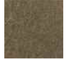
25296 Dark Pebble