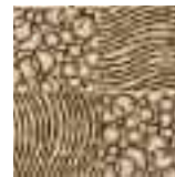
2521B/16x6 Geyser Insert Hot