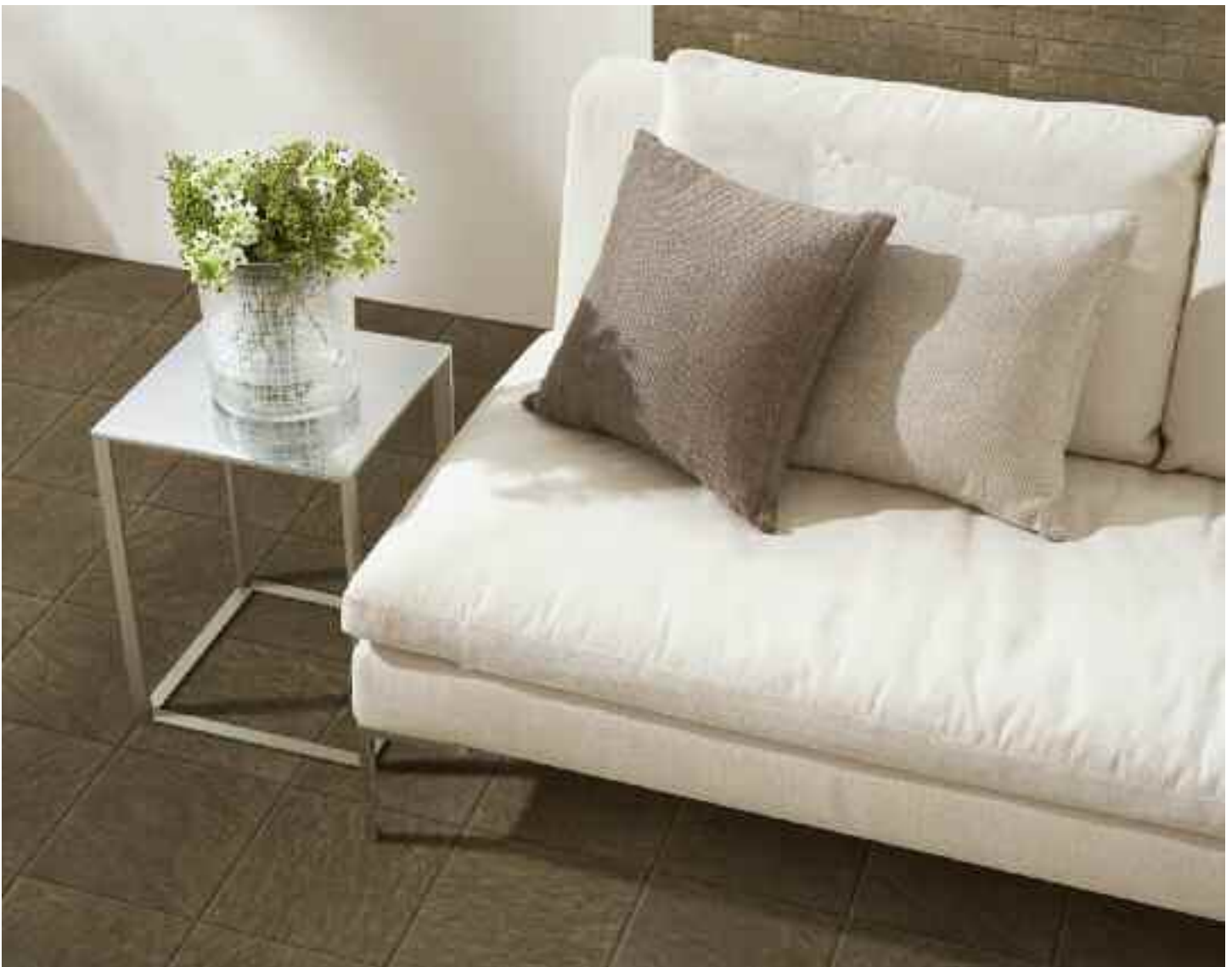
Shown: 25296/M2x4 Dark Pebble, 25296 12x12 Dark Pebble