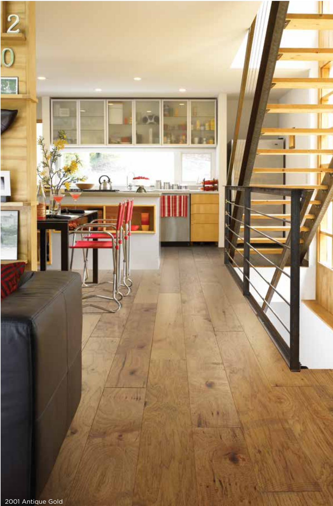
2001 Antique Gold