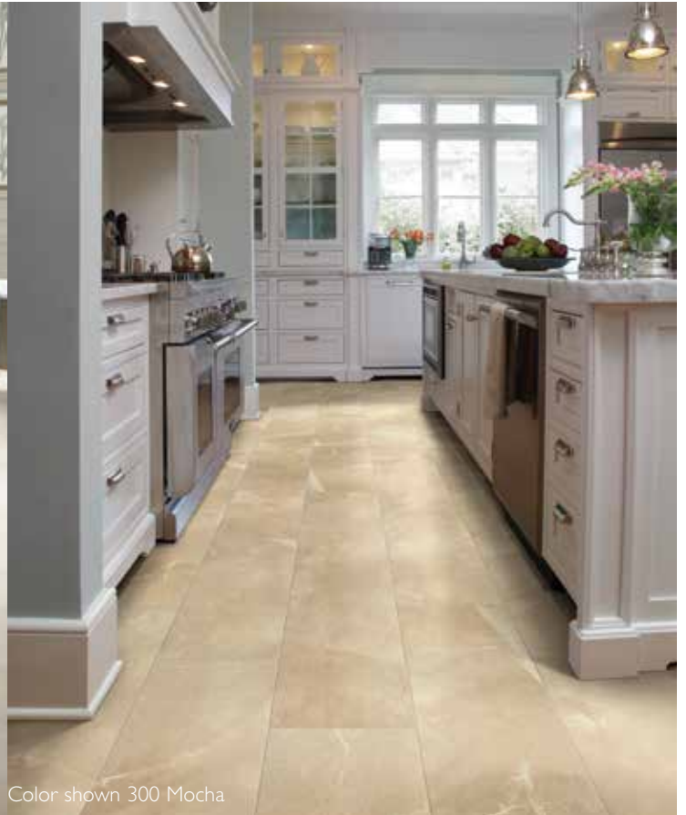
Color shown 300 Mocha