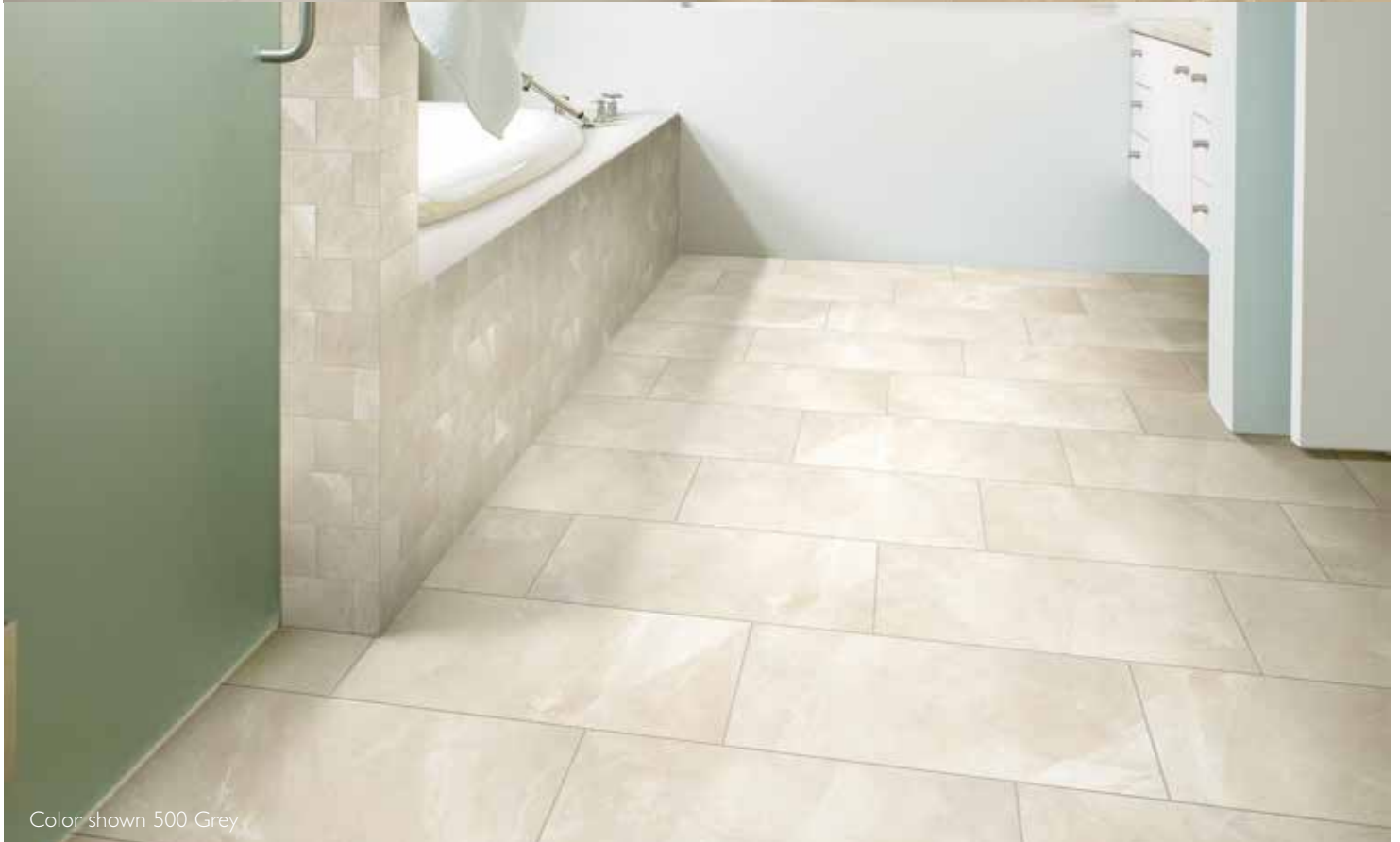
Color shown 500 Grey