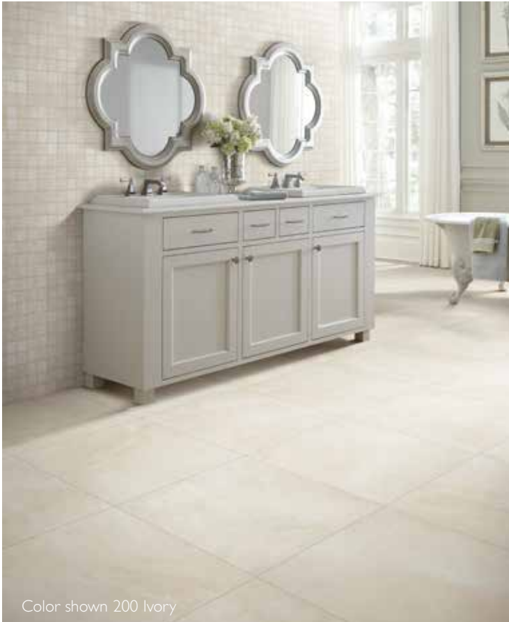
Color shown 200 Ivory