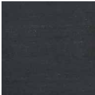
ADVANCED CHARCOAL UM09