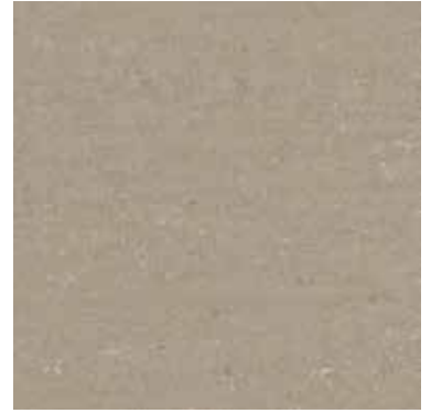
PROGRESSIVE GRAY UM07