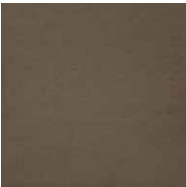
VISIONARY BROWN UM08