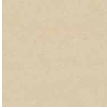
BEYOND BEIGE UM06