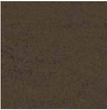
VISIONARY BROWN UM08