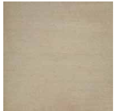
PROGRESSIVE GRAY UM07