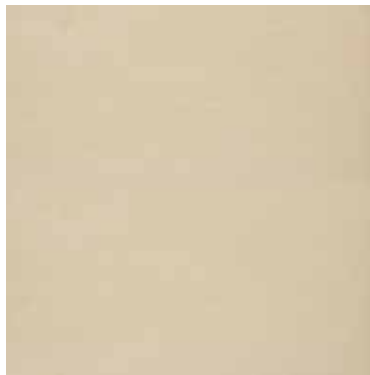
BEYOND BEIGE UM06