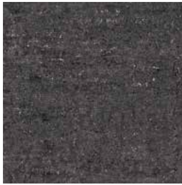
ADVANCED CHARCOAL UM09