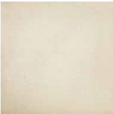
INFINITE CREAM UM05