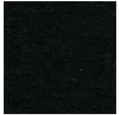
FUTURISTIC BLACK UM10