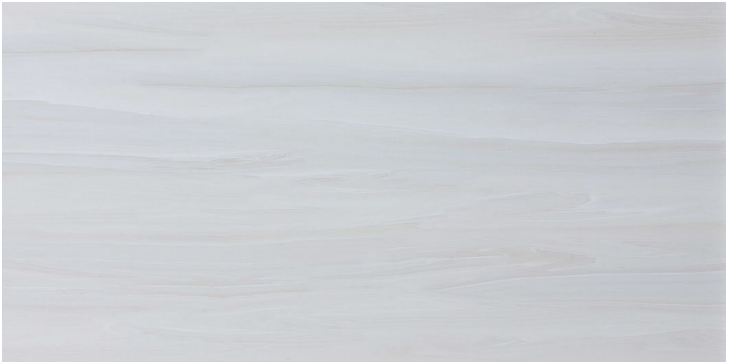
VISIONARY GLOSS CP05