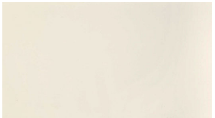
CANVAS GLOSS CP03 / CANVAS MATTE CP04