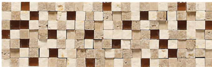
UNIVERSAL FD10 2 x 9 Stone and Glass Accent