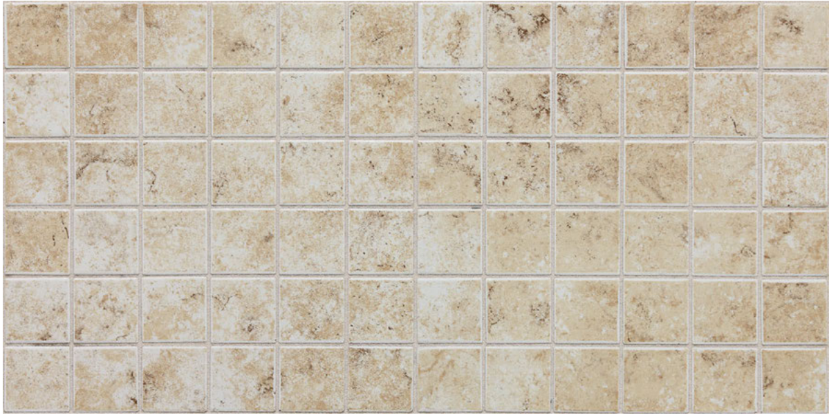
BIANCO FD01 2 x 2 Mosaic