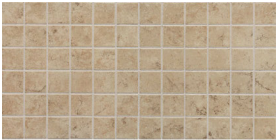
CAFÉ FD02 2 x 2 Mosaic