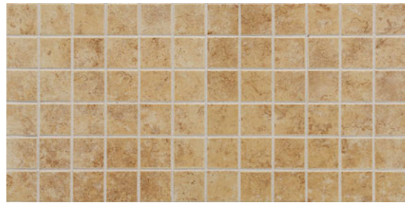
DORADO FD03 2 x 2 Mosaic