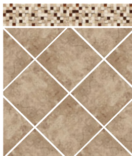
WALL DIAMOND PATTERN WITH ACCENT