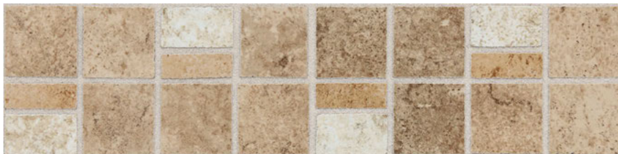
UNIVERSAL FD10 3 x 12 Border