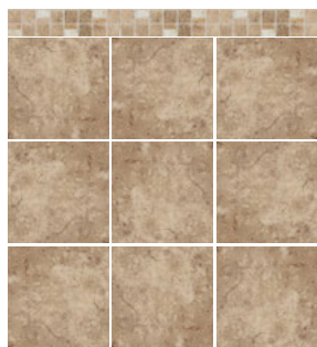
GRID PATTERN WITH FLOOR BORDER