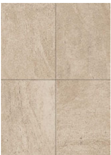
CHATEAU CRÈME AD01