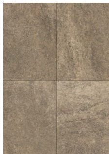
WEST TOWER AD02