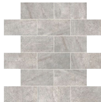
CASTLE ROCK AD03

Above photo features Castle Rock 10 x 14 wall tile with Glass Horizons Arctic Blend 3/4 x Random mosaic as a decorative accent. Cover photo features Chateau Crème 18 x 18 in a grid pattern on the floor.