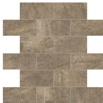
WEST TOWER AD02