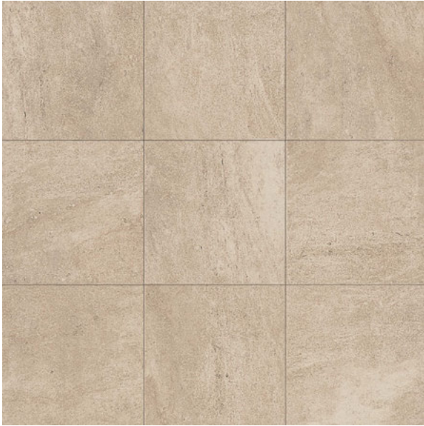
CHATEAU CRÈME AD01