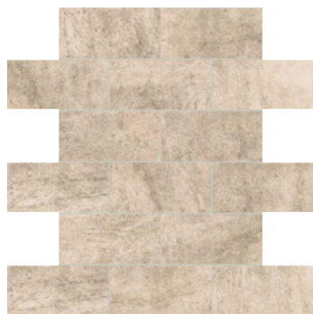
CHATEAU CRÈME AD01