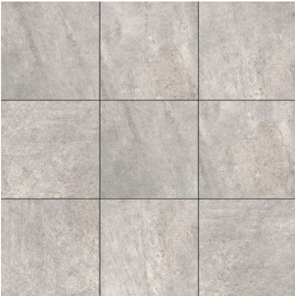
CASTLE ROCK AD03