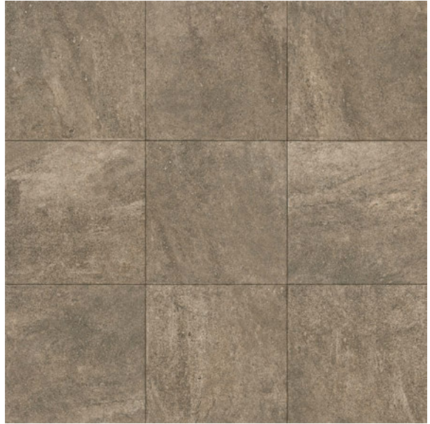
WEST TOWER AD02