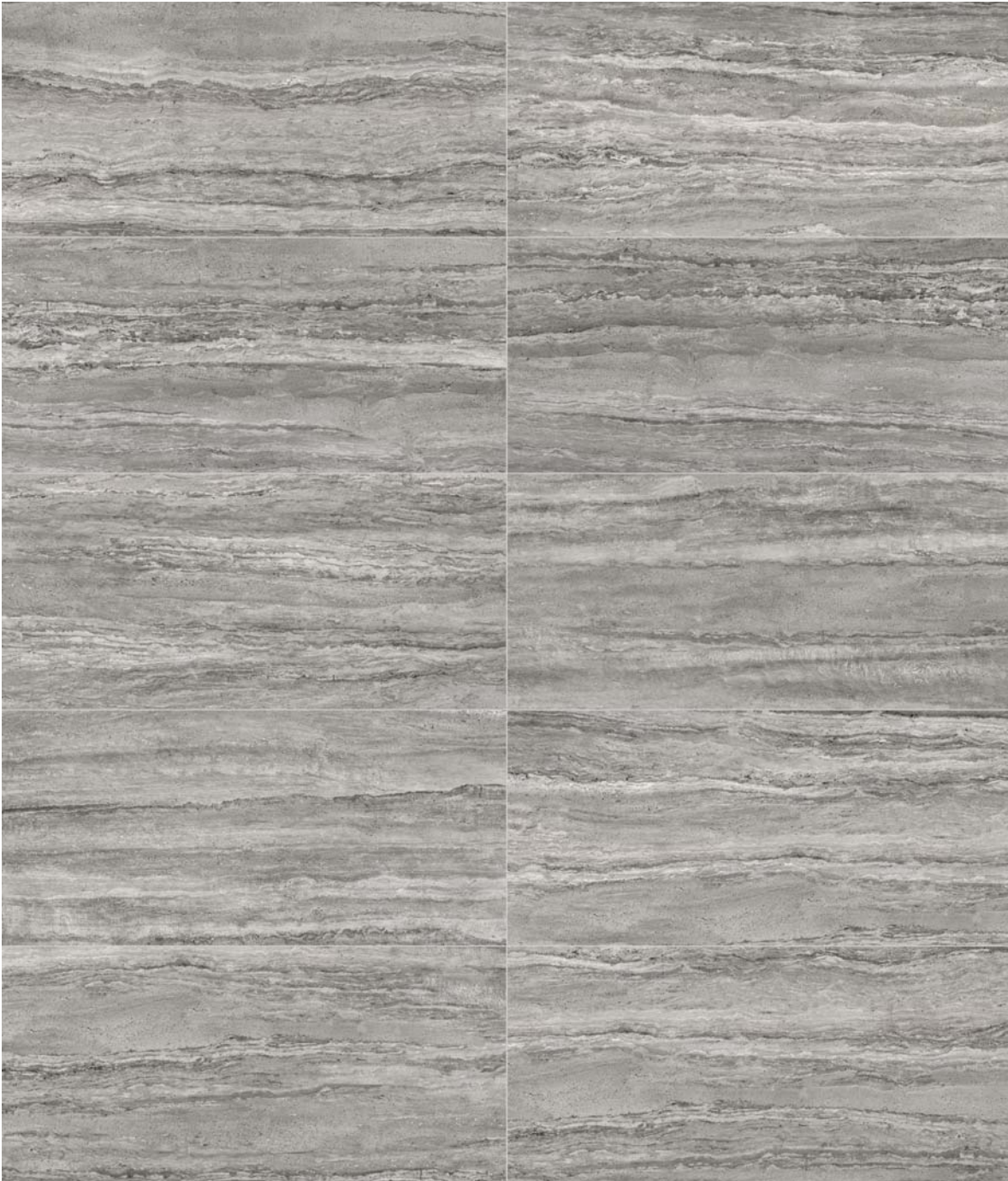
12" x 24" PRECEPT MICA HD PORCELAIN TILE