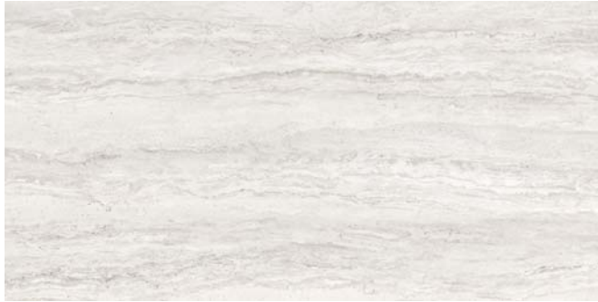
12" x 24" PRECEPT IVORY HD PORCELAIN TILE 69-290