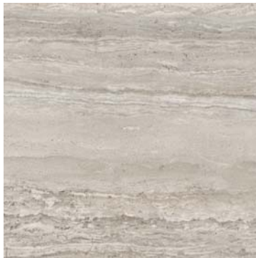
13" x 13" PRECEPT CLAY HD PORCELAIN TILE 63-514