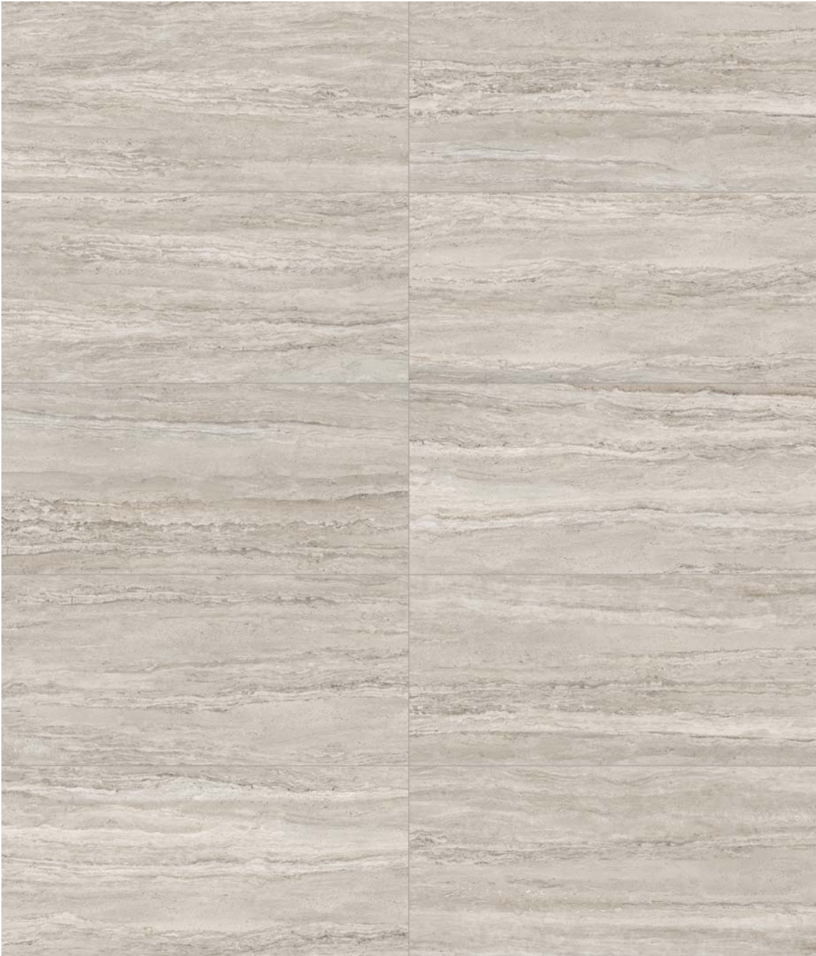
12" x 24" PRECEPT CLAY HD PORCELAIN TILE