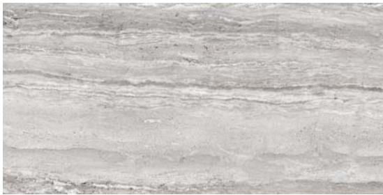
10" x 20" PRECEPT ICE HD GLOSSY WALL TILE 56-510