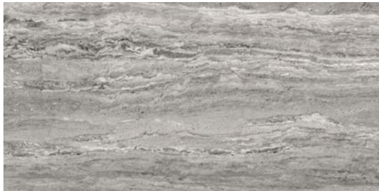
10" x 20" PRECEPT MICA HD GLOSSY WALL TILE 56-511