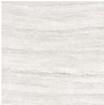
13" x 13" PRECEPT IVORY HD PORCELAIN TILE 63-513