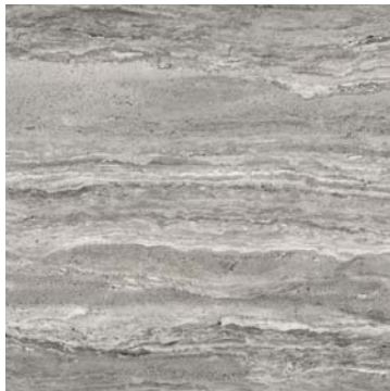
13" x 13" PRECEPT MICA HD PORCELAIN TILE 63-516