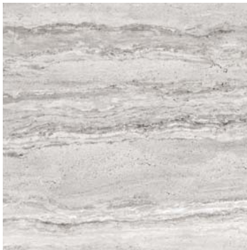
13" x 13" PRECEPT ICE HD PORCELAIN TILE 63-515