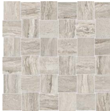
2" x 2" PRECEPT CLAY HD BASKETWEAVE PORCELAIN MOSAICS 63-518