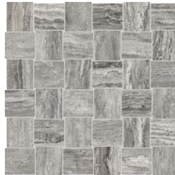
2" x 2" PRECEPT CLAY HD BASKETWEAVE PORCELAIN MOSAICS 63-520