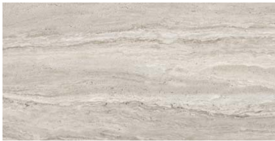
10" x 20" PRECEPT CLAY HD GLOSSY WALL TILE 56-509