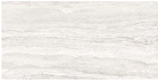
10" x 20" PRECEPT IVORY HD GLOSSY WALL TILE 56-508