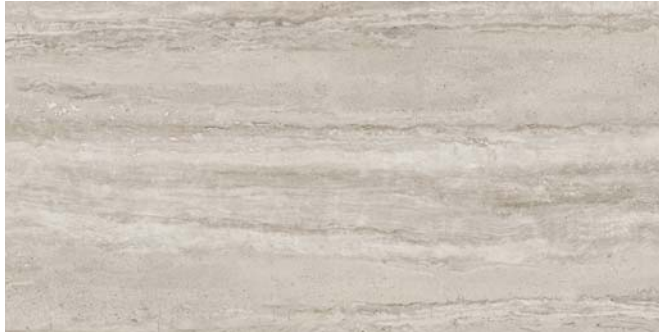
12" x 24" PRECEPT CLAY HD PORCELAIN TILE 69-291