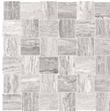
2" x 2" PRECEPT ICE HD BASKETWEAVE PORCELAIN MOSAICS 63-519