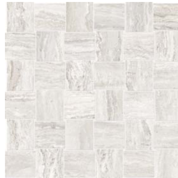
2" x 2" PRECEPT IVORY HD BASKETWEAVE PORCELAIN MOSAICS 63-517