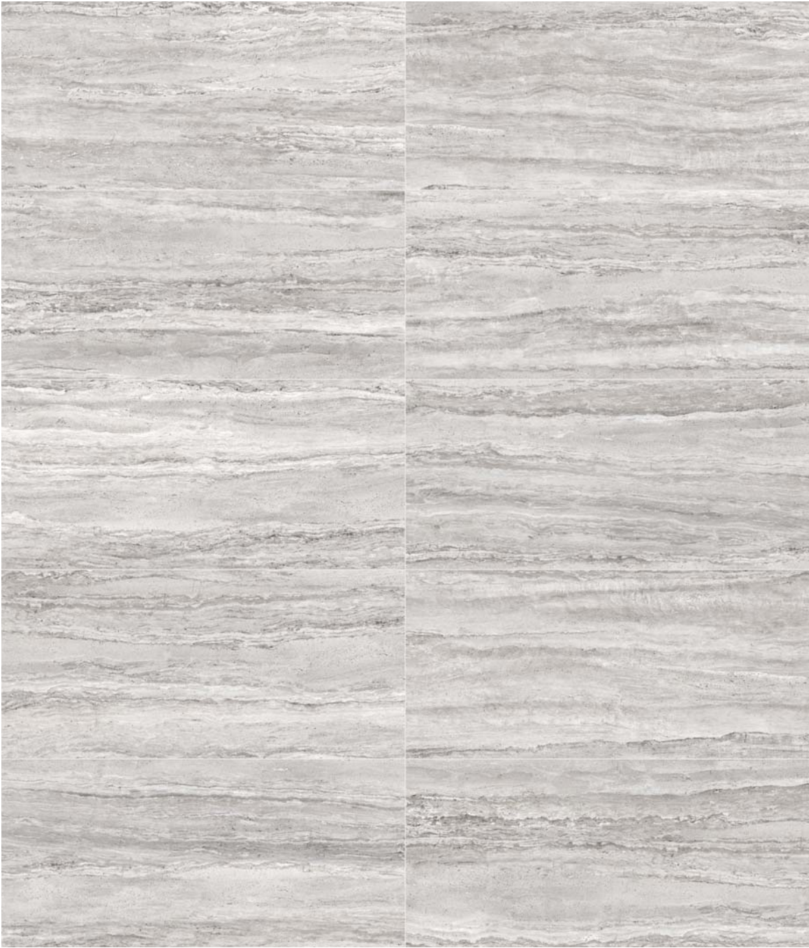
12" x 24" PRECEPT ICE HD PORCELAIN TILE