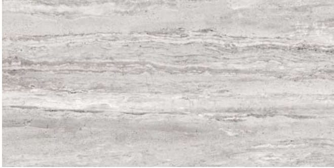
12" x 24" PRECEPT ICE HD PORCELAIN TILE 69-292