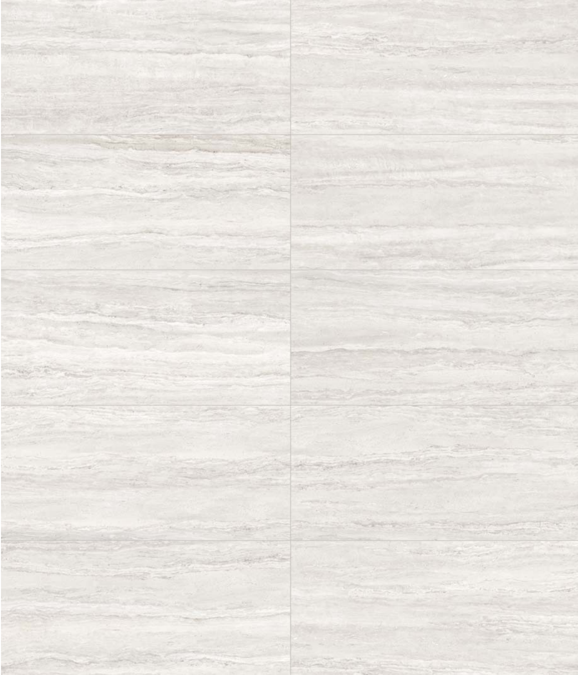
12" x 24" PRECEPT IVORY HD PORCELAIN TILE