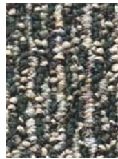
7968 Layered Earth