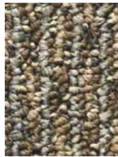
7831 Golden Umbers