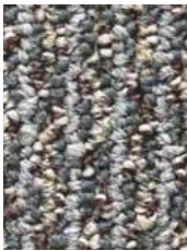
7558 Mixed Infusion