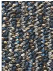
7579 Urban Indigo