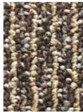
7868 Mixed Woods