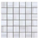
Era Mosaic 2"x2" on 12"x12" Mesh F02CHROER1212MO