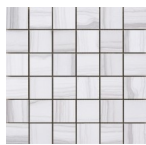
Memoir Mosaic 2"x2" on 12"x12" Mesh F02CHROME1212MO