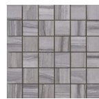
Script Mosaic 2"x2" on 12"x12" Mesh F02CHROSC1212MO