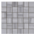
Record Mosaic 2"x2" on 12"x12" Mesh F02CHRORE1212MO