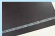
Bravo 200 sq. ft. per roll I32VS