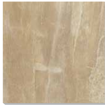
AJ3N Arte BG 19 9 / 16 " x 19 9 / 16 "