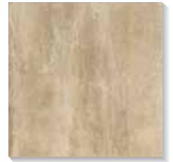
AJ3K Arte BG 12 15 / 16 " x 12 15 / 16 "