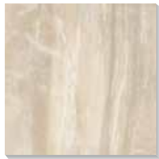
AJ3L Arte BI 12 15 / 16 " x 12 15 / 16 "