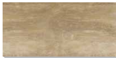
AJ3R Arte BG 11 11 / 16 " x 23 7 / 16 "