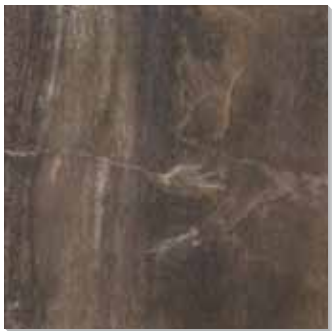
AJ3Q Arte MA 19 9/16 " x 19 9/16 "