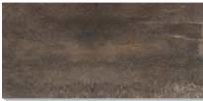
AJ3T Arte MA 11 11/16 " x 23 7/16 "