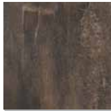
AJ3M Arte MA 12 15/16 " x 12 15/16 "