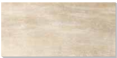
AJ3S Arte BI 11 11 / 16 " x 23 7 / 16 "