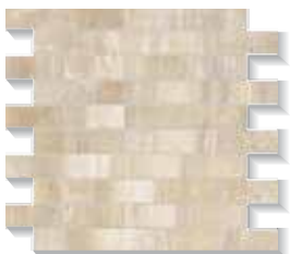
AJ3Y Arte BI Brick Mosaic 12 15 / 16 " x 12 15 / 16 "