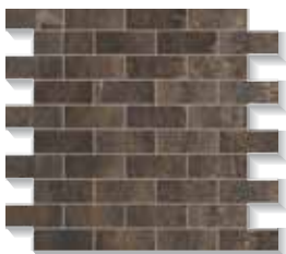
AJ3Z Arte MA Brick Mosaic 12 15/16 " x 12 15/16 "