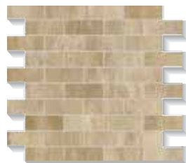
AJ3X Arte BG Brick Mosaic 12 15 / 16 " x 12 15 / 16 "