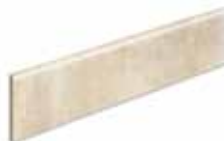
AJ33 Arte BI Bullnose AJ32 Arte BG Bullnose AJ34 Arte MA Bullnose 3" x 13"