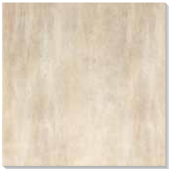
AJ3P Arte BI 19 9 / 16 " x 19 9 / 16 "