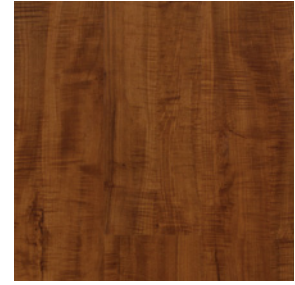
32IN401 | 32IN401G Jatoba Cayenne