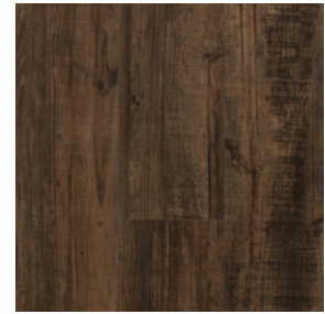
32LP1023 | 32LP1023G Long Pine Black & Tan