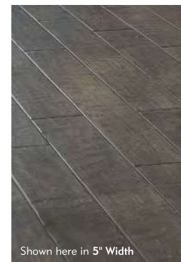
Shown here in 5" Width

Chickory, 5": AE212-27522 3", 5", 6.8": AE211-27522