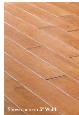
Shown here in 5" Width

Burlap, 5": AE212-27212 3", 5", 6.8": AE211-27212