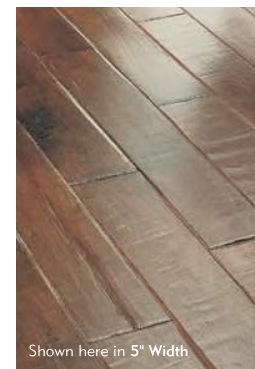
Shown here in 5" Width

Burlap, 5": AE212-27212 3", 5", 6.8": AE211-27212