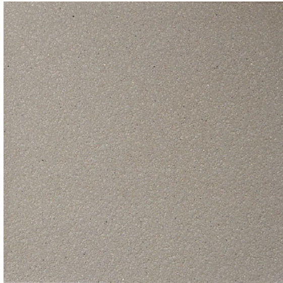
ARID FLASH 0Q48 (2)

(1), (2), (3) Indicate price groups, (1) being the least expensive All colors are available in abrasive grain 6 x 6. Only 0Q40 and 0Q41 are available in abrasive grain in 4 x 8. Double abrasive available on field tile in all colors on a special order basis.