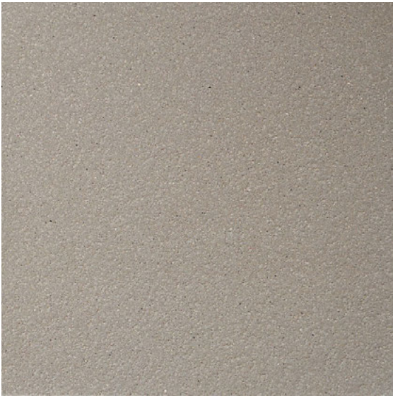
ARID GRAY 0Q42 (2)