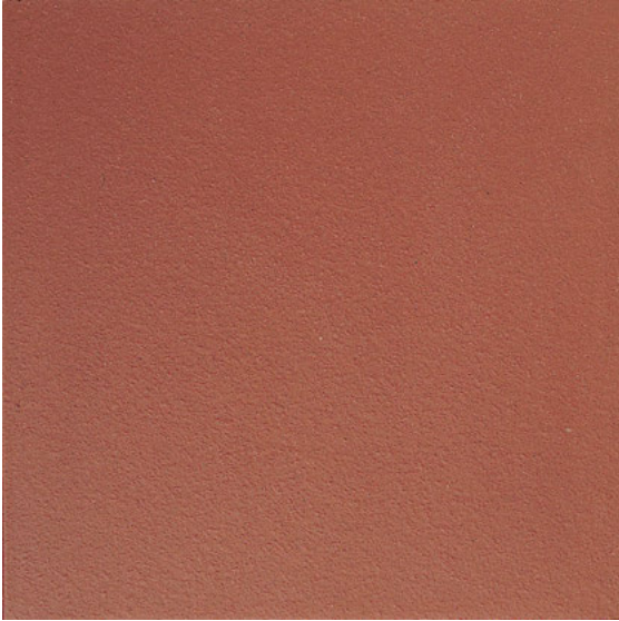
RED BLAZE 0Q40 (1)